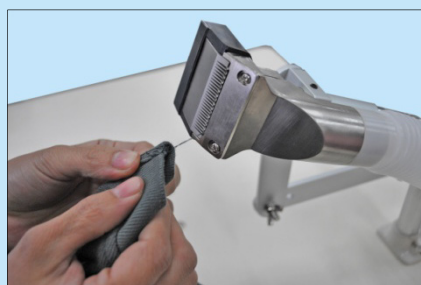
自動剪線及吸線頭 Thread trimming and sucking